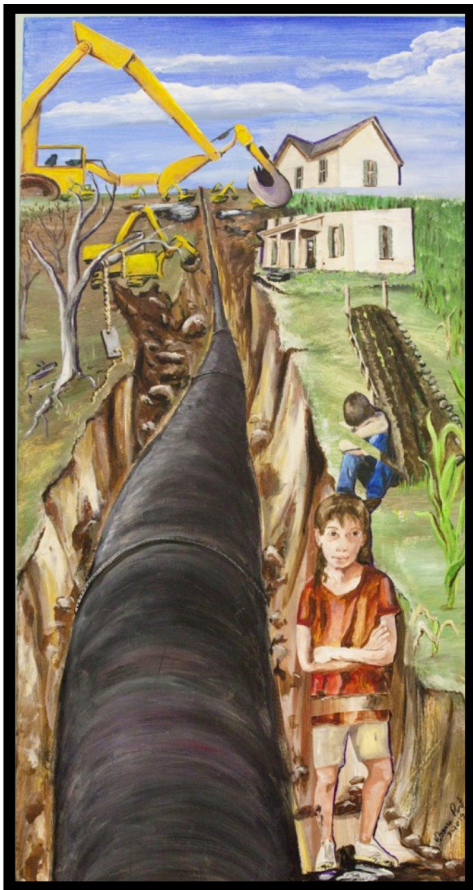
7 The Leaguer -April - August 2020

One very special item on the League History Table was the framed original front page of the Ashland Daily Press from August 26, 1920 announcing the ratification of the 19th Amendment. It was a tangible connection to the huge 72 year struggle it took for women to win the vote. And a reminder of how much effort has to go into present day advocacy for clean government, good stewardship of our planet's resources, empathy and compassion for all our human family, and justice in our governance.